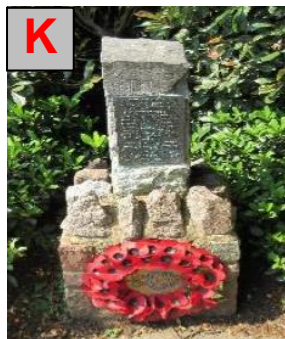
K – A stone from the ruined church at Nijmegen in Holland, a memorial to the US 82 nd Airborne troops who died, who were based in Quorn in 1944.

J – Arc II, derived from the fossil vertebrae of a large mammal. One of the five sculptures made from Millstone Grit from Wright’s Mill chimney in the late 1990s.