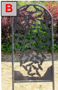
B – Bat Sculpture by Martin Heron in 2000.