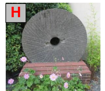
Stafford Orchard Park