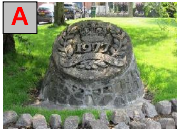
A – Commemorating Queen Elizabeth II's silver jubilee in 1977. Read the plaque on the back about 'The Bank'.

Referring to the Location Map, starting at the Quorndon Fox, head down High Street. Sculptures in areas A, B, C, D, E and F can be viewed by taking short excursions into Church Lane and Church View Gardens. Do not forget to look up to take in F.