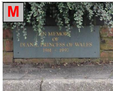
M – A plaque attached to a triangular flower bed, as a memorial to Princess Diana, 1961 to 1997.

Leave Stafford Orchard via the large gated entrance and turn right, following the road to the right passing the Apple Tree pub to your left into Stoop Lane. At the island junction with School Lane view M.