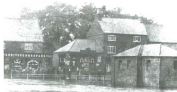
THE LOCKUP 1932

The main entrance to Stafford Orchard will still be past the lock-up (pizza takeaway) on Station Road but the triangle of land on which the lock-up stands, which also accommodates the public toilets, will get a facelift.