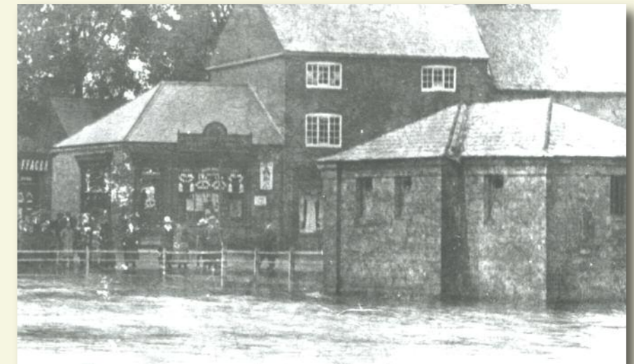
The Lock Up in the floods c1930

Find out more about Quorn's history at www.quornmuseum.com